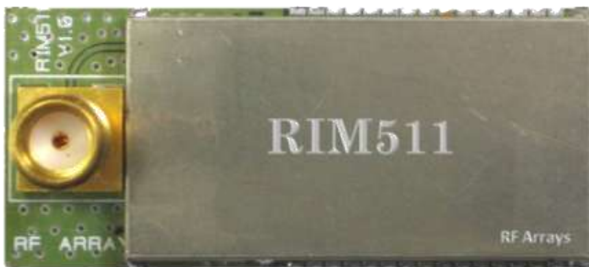
40mm x 18mm